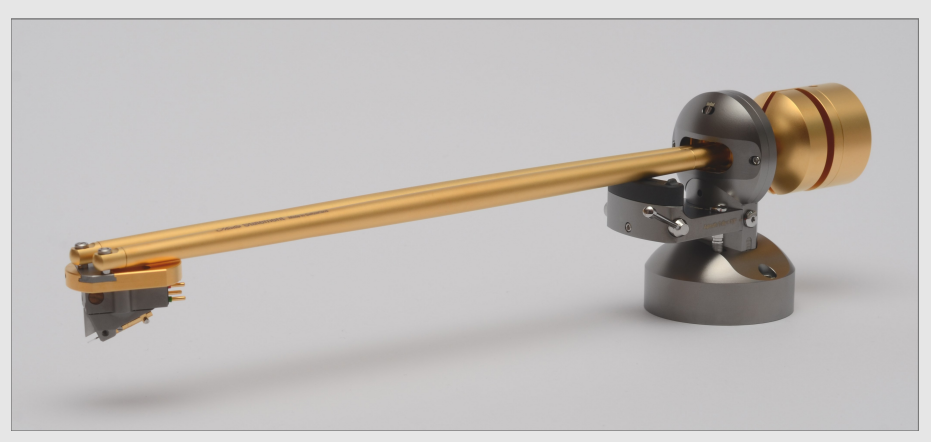
Thales Statement Gold

Arm-tubes, head and counter-weights rhodium coated Base-ring, shaft and bearing unit dark ruthenium coated