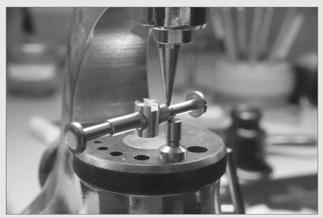
Assembling vernier for azimuth