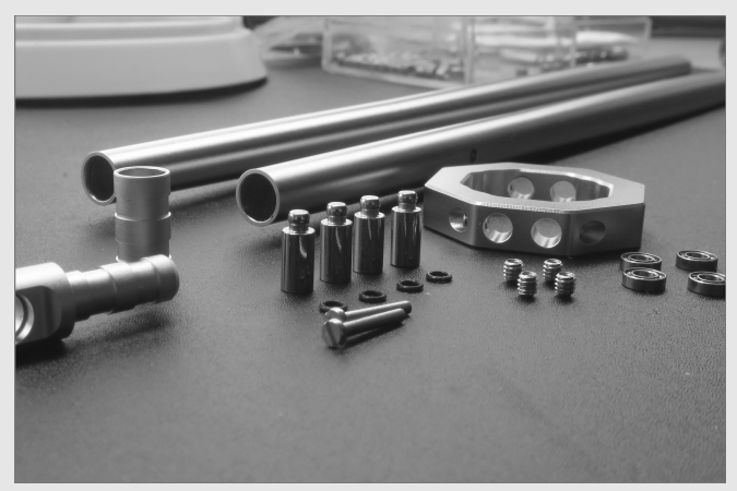
Parts for bearing-unit and arm-tube

The THALES STATEMENT comes with an integrated mechanism and a scale for fine adjustment of VTA and azimuth, allowing precise angular alignment of the cartridge. The support of the tonearm lift, coupled directly with its lever, works by a high reduction ratio so that the needle may be lowered in a perfectly controlled manner.