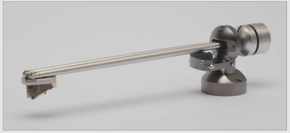
Thales Statement Silver

Arm-tubes, head and counter-weights rhodium coated Base-ring, shaft and bearing unit dark ruthenium coated