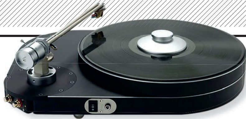
ABOVE: The Simplicity II tonearm wires can be terminated via block connections with DIN/RCA/XLR sockets or direct wired phono (RCA) leads which cost extra. Rocker switch next to its charger input caters for standby/off/charge settings

The partnering Simplicity II tonearm is an exquisite piece of design that succeeds in minimising tracking error throughout the arc its describes across the LP radius. Friction within the fine gimbal bearing is very low indeed at <10mg (both planes) and achieved without play. However the necessary complexity of the structure encourages a more complex resonant behaviour [see Graph 2, below]. The various bending and torsional modes of both arm tubes are reflected at the headshell on 105Hz-450Hz with higher-Q modes (possibly from the bearing or arm lift structures) at 580Hz and 1.4kHz. Readers may view full QC Suite reports for Thales's TTT-Compact turntable and Simplicity II tonearm by navigating to www.hifinews.co.uk and clicking on the red 'download' button. PM